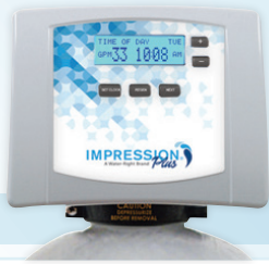
Impression Plus® model shown with backlit display and top flange